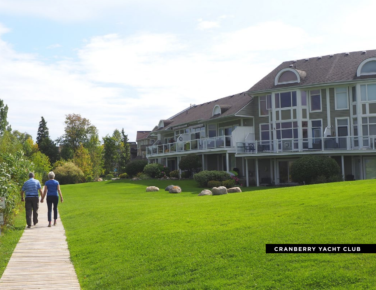
CRANBERRY YACHT CLUB